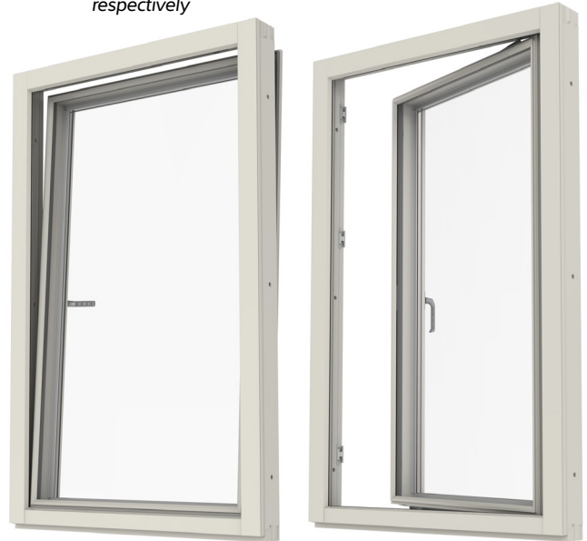
Airing position (Kipp)